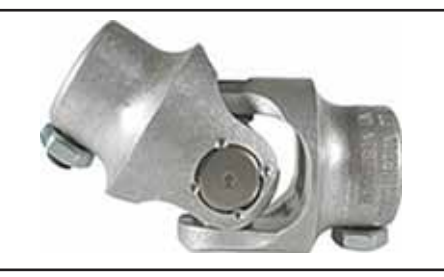
Zero-play, sealed universal joint is machined from solid steel.

What makes the Borgeson steering shaft so good? Grantmeyer says it's the precision, zero-play, sealed needle-bearing universal joint that's machined from solid steel.