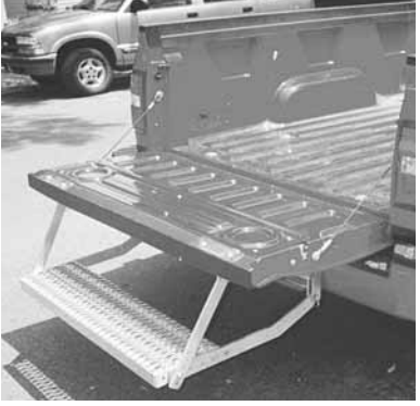
Add-on step bolts onto pickup's bumper and also onto back side of tailgate.