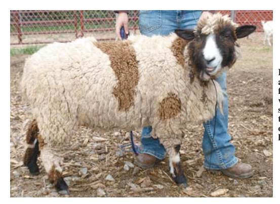
Harlequin sheep are cute with fluffy spotted wool, and are small and gentle to handle. Some of them even have blue eyes.