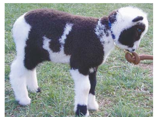
"It's an amazing breed that has everything anyone wants in a sheep," says Hope Bennett, who sells breeding stock.