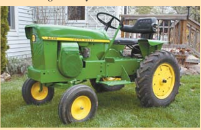
Smith turned a 1973 Deere 110 garden tractor into this 1/2-scale Deere 2030.