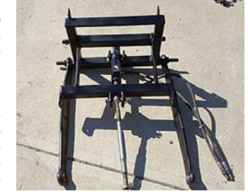
Hitch fastens to utility vehicle's receiver hitch and comes with 2 bolt-on brackets that hook up to vehicle's frame.

"I find I no longer have a stiff and sore back after a day spent cutting firewood, because I don't have to stoop to pick up heavy firewood. My hands never touch the log so I never get them wet or dirty. It also eliminates splinters and bruised knuckles," notes Elliott.