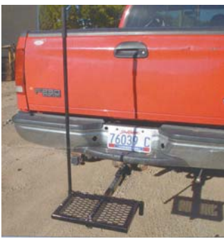
Tailgate step fits into receiver hitch. It comes with a 42-in. long handle that slips into a hole on either side of step.

Contact: FARM SHOW Followup, Koehn Marketing, Inc., P.O. Box 577, Watertown, S. Dak, 57201 (ph 800 658-3998 or 605 886-2120; koehn@iw.net; www.koehnmarketing.