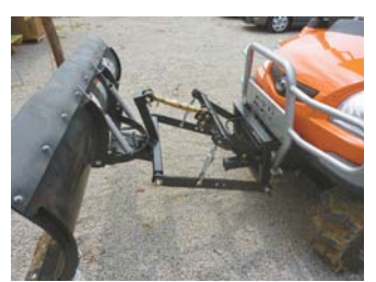
Hitch can also be mounted on front of vehicle and used to support this 3-pt.

The Plowboy sells for $1,395 plus S&H. Also available is a hydraulic kit that mounts under the utility vehicle's hood. It comes with six 10-ft, hydraulic lines and hydraulic quick disconnect valves. The kit has 4 accessory ports, providing front and rear hydraulics, and operates off the utility