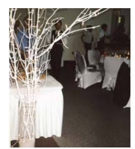
Tree branches are painted white and stuck into sand-filled vases, with strings of mini electric lights added.