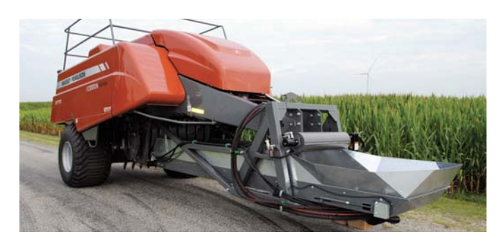
Bolt-on unit allows combine to pull baler, harvesting grain and crop residue at same A hydraulic motor, powered by an independent hydraulic pump on combine, drives baler.