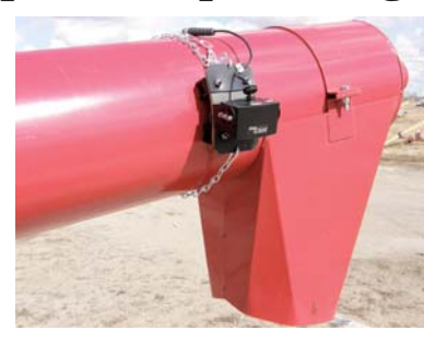
Magnetic camera system helps operator on ground line up auger with opening on top of grain bin.

The camera takes color video, and has a 110-degree angle and 28 infrared illuminators to allow 32 ft. of visibility in the dark.