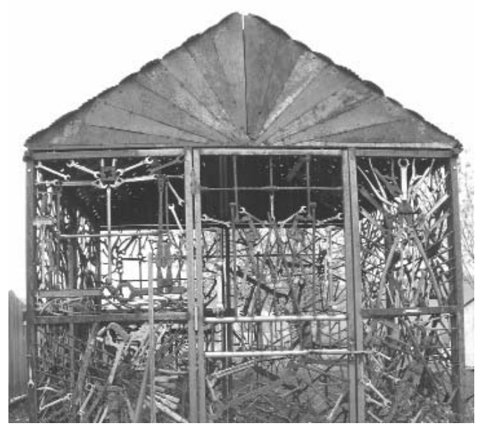
Mike Druffel created this artistic tool shed out of castoff tools.