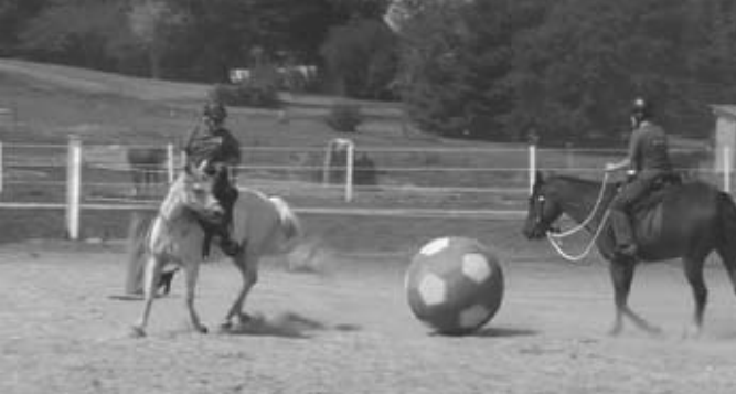
To play "Equi-Soccer", horses bump and kick a 3-ft. ball across a field or arena to a goal zone. Horses from another team try to steal the ball.