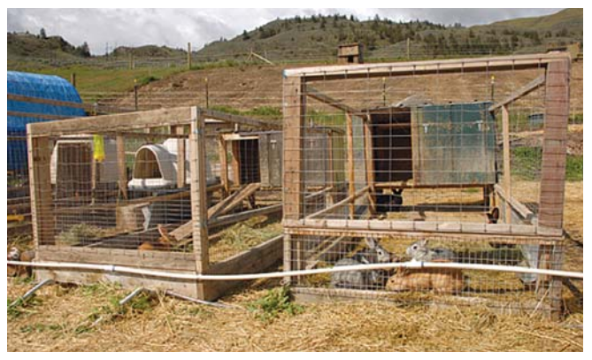
Moveable rabbit hutches are connected to an automatic water system. Rabbits get lots of playtime in the roomy pens.

Felder says she needs to improve accessibility and ease of cleaning the cages.