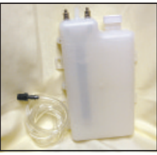
Compact unit measures only 5 in. wide by 7 1/2 in. long and 2 1/2 in. thick.

Herold has sold more than 100 of his systems, which he has priced at $125. He offers an EFIE switch for adjusting the mixture of fuel and air for $15. He also has a website