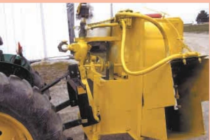
Tractor pto belt-drives a big 28-in. dia. squirrel cage fan and a spray pump.