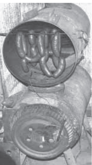
Stove was made from a 30-gal. water pressure tank mounted on four pipe legs. An old 20-gal. oil barrel that serves as the smoker is bolted on top of stove. Homemade sausages hang from metal rods.