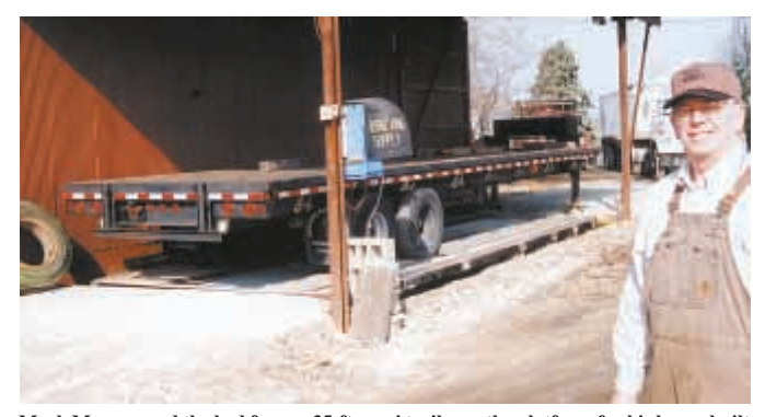
Mark Musser used the bed from a 35-ft. semi trailer as the platform for his home-built weigh scale. He installed four load cells under it, one at each corner.