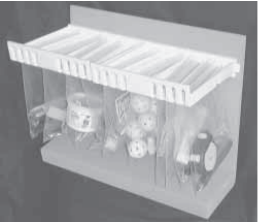
Rack is made from hard plastic and holds eight zip-lock plastic baggies. Bags slip into parallel slots for storage.

Contact: FARM SHOWFollowup, Anchor Industries, 1100 Burch Dr., Evansville, Ind. 47725 (ph 866 343-7646 or 812 867-4628; email:info@ germinators.com; website: www.germinator.com).