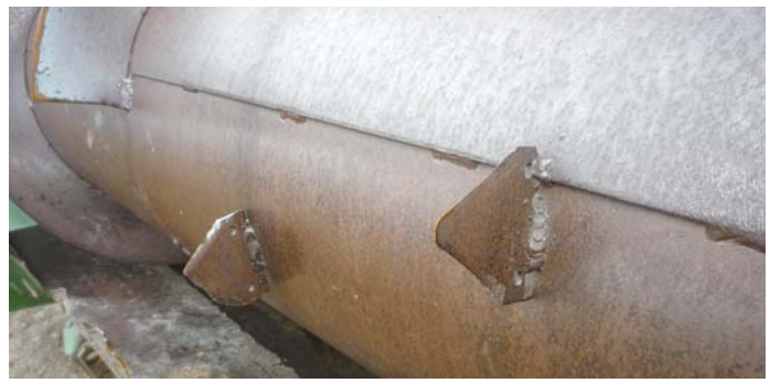
Sickle blade-style grain grabbers are welded into center of auger where they help feed