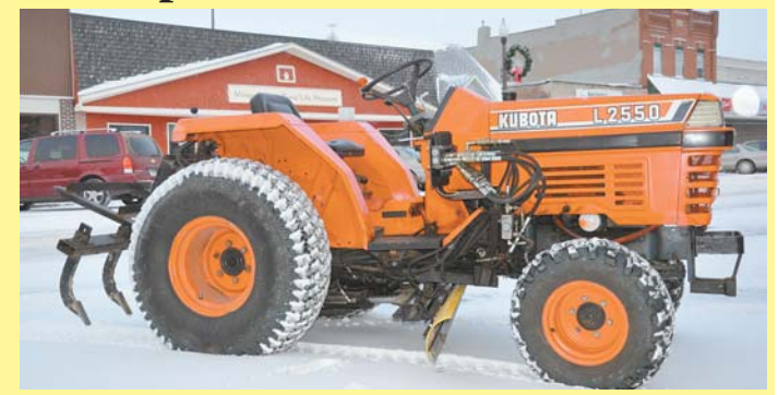
Hydraulic-operated, belly-mount grader is designed to attach to 2 or 4-WD tractors with 45 hp or less. "It lets you grade roads too small or inconvenient for conventional graders on bigger tractors," says inventor Randy Leith.

"The whole unit, except for the mounting brackets, can be removed by taking out three pins and disconnecting the hydraulic lines with the quick disconnects that are supplied with the unit," says Leith.