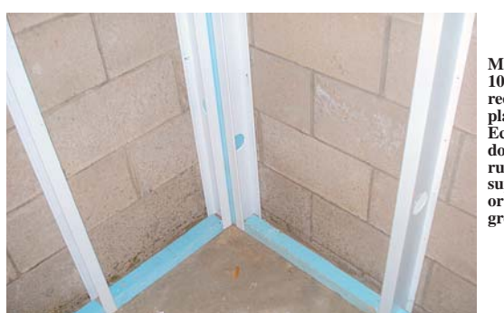
Made of 100 percent recycled plastic, the EcoStud doesn't rot, rust, or support mold or mildew growth.

Expect to pay more for EcoStuds up front, but Kiilunen says installed cost of the system is less because they install with substantially less labor, and since they are made of plastic they outlast wood and steel as long as they