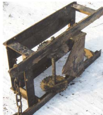
Sod cutter cuts a 12-in. wide, 2-in. thick strip of sod. Photo at right shows unit placed on its side to display saw blades and angled knife.