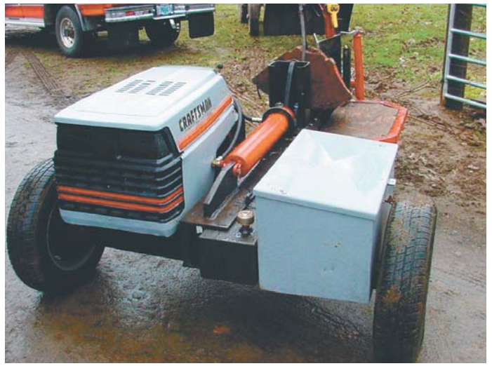
He replaced the mower's front wheels with an old trailer axle. A 24-in. hydraulic cylinder does the splitting.