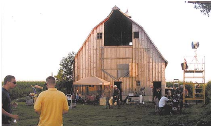
This Iowa farmstead was rented to a company that used the farm to make a horror movie. The rundown barn became a ready-made movie prop.

Contact: FARM SHOW Followup, AdAirlines LLC, 2859 Central St., Evanston, Ill. 60201 (ph 773 785-3100; www. adairlines.com).