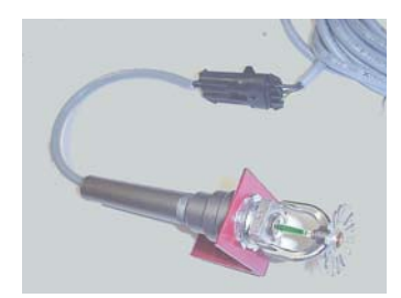
When Heat Scope detects a preset temperature it sets off an alarm.

"You generally have about four minutes maximum from detection of a fire before it's beyond saving," he says. A basic setup priced