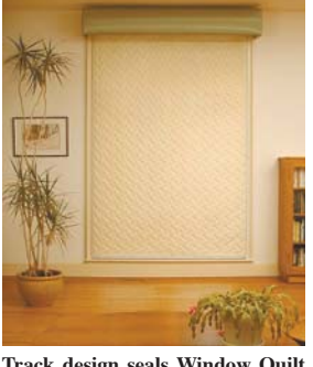
Track design seals Window Quilt to window on all four sides.

Contact: FARM SHOW Followup, C. F. Marley, 26288 Oconee Ave., Nokomis, Ill. 62075 (ph 217 563-2588 or 217 827-1507).