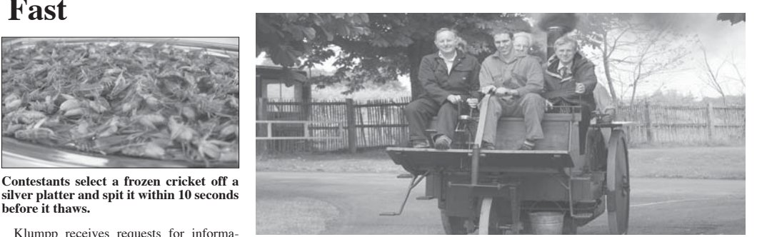
Grenville steam carriage was built way back in 1875. It's believed to be the oldest, self-propelled passenger vehicle in the world.