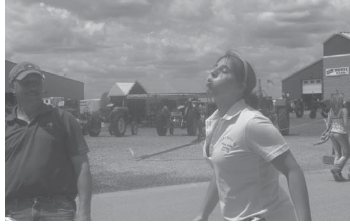
The all-time record for cricket-spitting is 28 ft. 10 in.