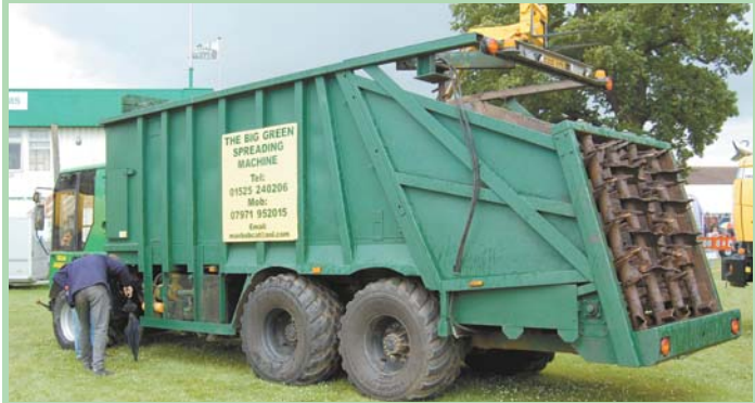
Four vertical spreader beaters mount on back of garbage truck. Truck's original hydraulic-operated ram pushes manure onto chain-driven slat floor in front of beaters.