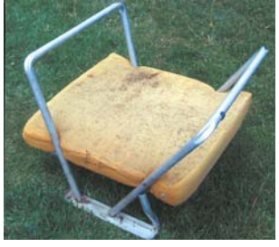
Stripped-down lawn chair was flipped upside down to make kneeler.