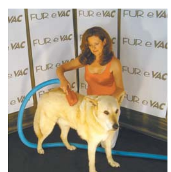
Bristle loosens shedding fur, and it's sucked into vacuum cleaner.

The poly tool has a tapered end tube that fits vacuum cleaner hoses with an inside diameter measurement between 1 3/8 and 1 9/16 in. The tool's bristle design loosens shedding fur and self-clears with reverse strokes. A large vacuum chamber built into the