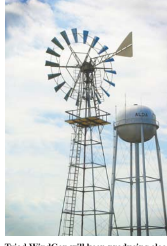
Triad WindGen will keep producing electricity when 2 and 3-blade turbines shut down, says the company.

He adds that the Triad WindGen is user friendly too. "We wanted to build a wind generator that was dependable and low maintenance," he says. "How-