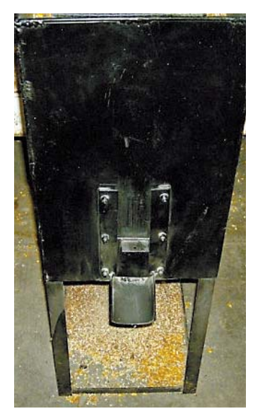
Corn bounces off the sloped screen, through a sliding door, and into a 5-gal. bucket.

The device also provides Grose with a fire starter and bird feed. He picks out the larger