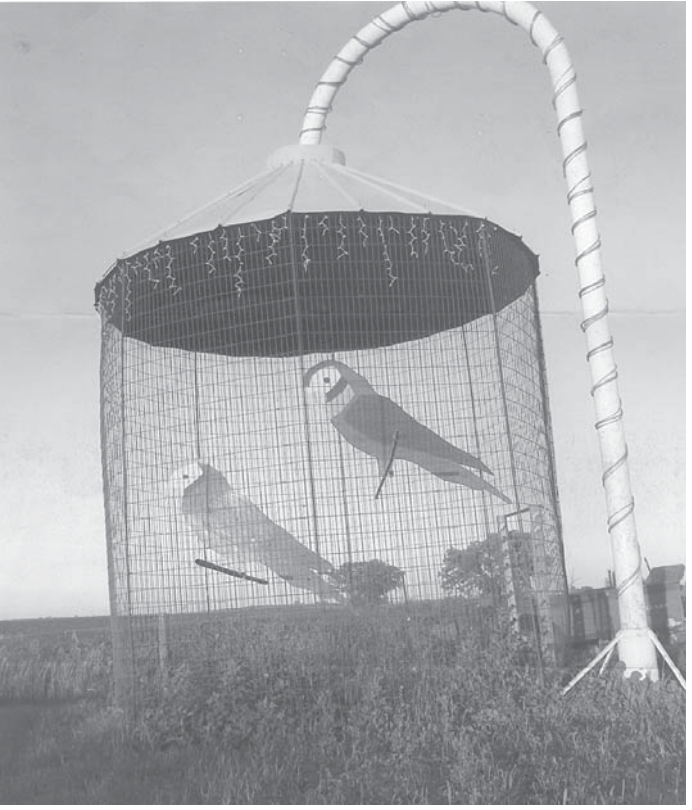
A 14-ft. dia., 20-ft. high corn crib serves as a "cage" for these two giant wood parrots on a farm near Lewiston, Minn. Cage is held up in the air by a giant candy cane.