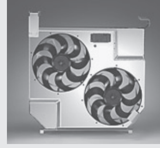
Dual electric fan uses less power.

hicle has a gross vehicle weight of more than 18,000 lbs. we recommend you stay with a belt-driven fan.'