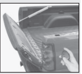
Tailgate raises, lowers at push of a button.

Contact: FARM SHOW Followup, JSC Engineering, 26500 West Agoura Road, Suite