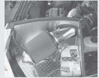
Intake on a 7.3-liter Powerstroke diesel.

The unit is completely sealed from engine heat and also features the industry's first Hi-Flow crankcase ventilator