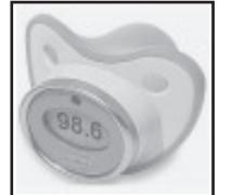
Pacifier has readout on front with baby's temperature.

Contact: FARM SHOW Followup, Summer Infant, 1275 Park East Drive, Woonsocket, Rhode Island 02895 (ph 800 268-6237).