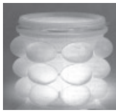
Slip-in storage bucket seals off egg-shaped cube makers.

Contact: FARM SHOW Followup, Raymond & Co., P.O. Box 5121, Winter Park, Florida 32793 (ph 407 831-0102; www.Raymondandco.com).