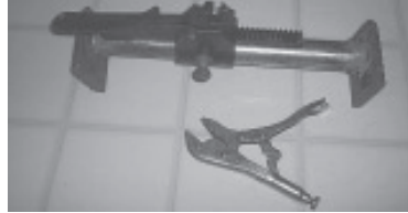
Tightening the load lock's ratchet lever stretches pants to desired size.