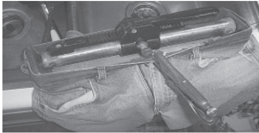
Modified "load lock" was originally used on a semi tractor.

Combine: 1/2 cup white vinegar, 1 cup ammonia, 1/2 cup baking soda, 1 gal. warm water. Use in a spray bottle.