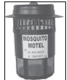
When mosquitoes enter unit, a fan pushes them down into capture net at bottom where they die.

Contact: FARM SHOW Followup, Mosquito Mart, Inc, 11475 Hwy. 90, Beaumont, Texas 77713 (ph 409 866-6855; www.mosquitomartinc.com).