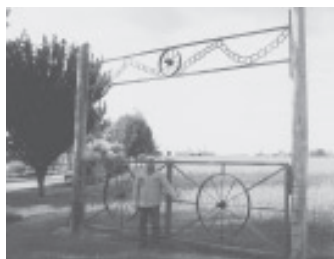
Beautiful "wheeled gate" reflects Herschberger's love for horses.

Contact: FARM SHOW Followup, Ernie Herschberger, 4136 East County Road 1600 N., Humboldt, Ill. 61931 (ph 217 254-1107).