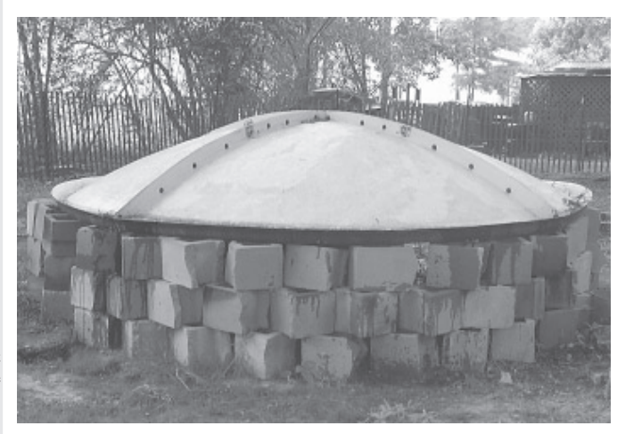
Satellite dish is turned upside down on three rows of concrete blocks, with the blocks in each row set at different angles for better ventilation.

Contact: FARM SHOW Followup, Jerry Dutton, 870610 So. 3460, Chandler, Okla. 74834 (ph 405 258-2507).