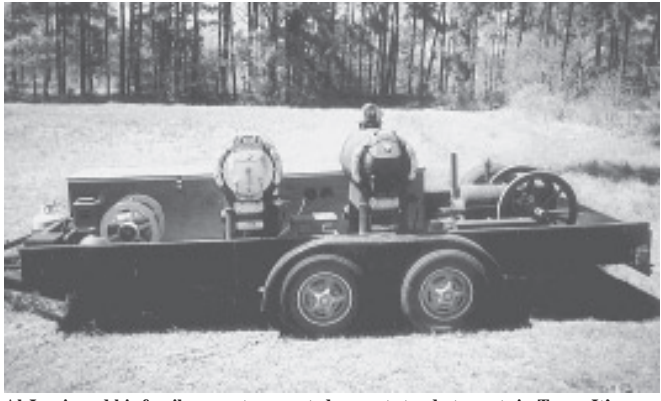
Al Jarvis and his family operate a roasted peanut stand at events in Texas. It's complete with antique flywheel engines and coffee bean roasters.

(0) 800 085 1744; info@leaflog.com; www.leaflog.com).