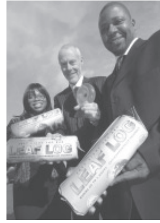
A mixture of 70 percent leaves and 30 percent wax is compressed into 3-lb. logs.

Contact: FARM SHOW Followup, BioFuels International Ltd, Unit 19, Boulton Industrial Estate, Icknield Street, Birmingham, United Kingdom B18 5AU (ph 011 44