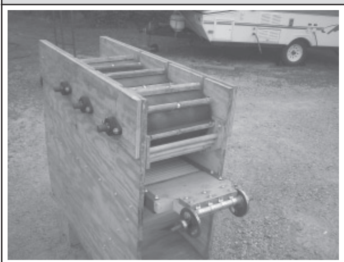
Latest version of mini thresher is powered by a 5 hp gas engine.

If you've found or heard about a new income-boosting idea, we'd like to hear about it. Send details to: FARM SHOW Magazine, P.O. Box 1029, Lakeville, Minn. 55044 (ph 800 834-9665) or email us at: editor@farmshow.com.