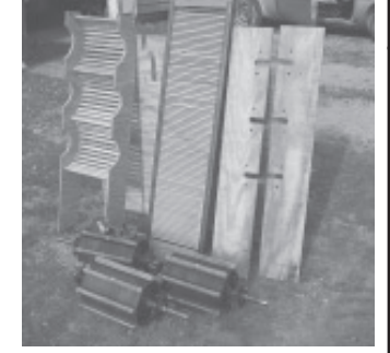
Different screens are available for threshing a variety of grains.

The first machine threshed about two bushels/hour and Hillis hopes to improve on that. Instead of running it off a pto, the new machine can run off a 5 hp gas engine. He also upgraded the wood stove fan from his first machine with a paddle fan, similar to those on old combines. The new machine has three cylinders instead of two and a straw walker that moves the straw out with a screen below for grain to drop through into a container. The thresher will be