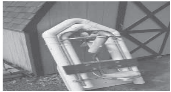
Paddleboat floats on 4-in. dia. pvc pipe; supports kids weighing up to 80 lbs.

Contact: FARM SHOW Followup, Michael Coblentz, CRM Distributing, 4922 Township Rd. 401, Millersburg, Ohio 44654 (ph 877 276-3478).