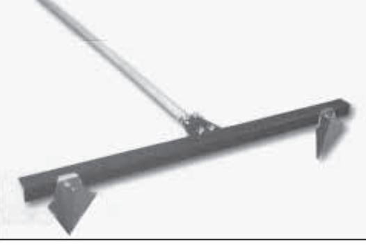
Bolt-on, V-shaped spades can be adjusted for different row spacings.

To build the paddleboat, Lanser cut a 10-ft. length of the pvc pipe into sections which he then joined together into a "V" shape on front. There are two sets of pipe, one inside the other, and they form a 90 degree bend on front with a 45 degree bend on each side.