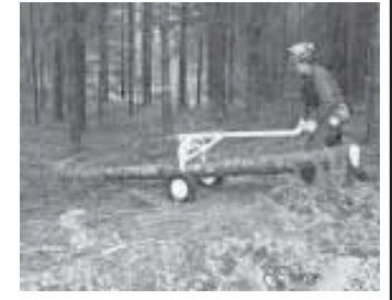
Although it weighs just 57 lbs., log mover can move up to 15 times its own weight.

Contact: FARM SHOW Followup, Future Forestry, P.O. Box 1083, Willamina, Oregon 97396 (ph 888 258-1445; fax 503