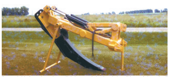
Janssen's big 3-pt. ripper has a slightly curved shank to bring ribbons of clay subsoil up to the surface. Shank angle can be adjusted on-the-go by extending or retracting a pair of hydraulic cylinders.

Contact: FARM SHOW Followup, RicksonTruck Wheels, 11204 McCormick Road, Hunt Valley, Md. 21031 (ph 410 771-9501; toll free 800 587-7633; fax 410 771-9504; info@ricksontruck.com; www. ricksontruck com)