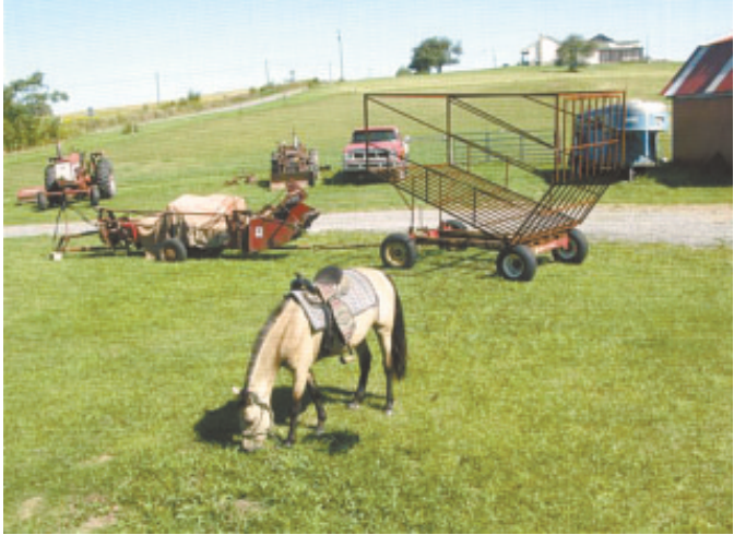
Koch spent only about $700 to build self-loading gravity basket for small square bales.

Contact: FARM SHOW Followup, Brenden Janssen, P.O. Box 75, Vega, Alberta, Canada T0G 2H0 (ph 780 674-5920; tubalcaintechnologies.com).