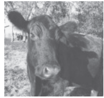
Girl, a 9-year-old Angus cow, has been blind since she was a calf.