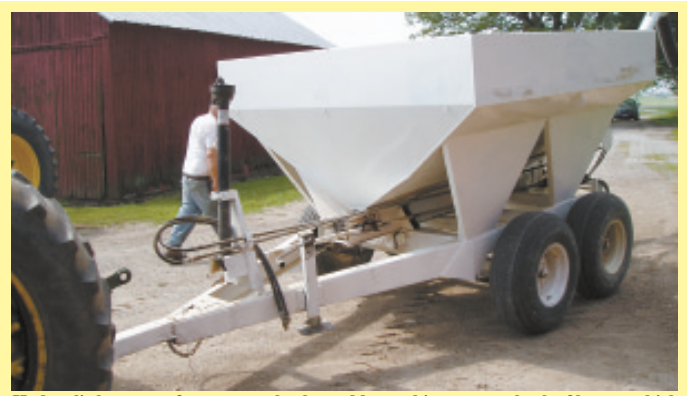
Hydraulic hoses run from tractor back to add-on orbit motor on back of buggy, which is used to drive the auger.

The buggy's spreader system was originally pto-driven, and the drag chain originally ran off a ground-driven tire. Evans removed the spreader system on back of the buggy and mounted a gearbox, allowing him to redirect the spreader's pto shaft through the gearbox to operate the drag chain. He fabricated a