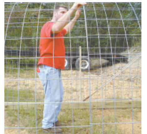
He bent a 16-ft. long cattle panel, placing the ends inside both boards. He stapled and nailed the panel to the wood and wired the panel to the T-posts. Then he installed a second panel, tying the ends of the two panels together.