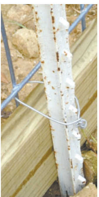
He started by pounding four T-posts into the ground, placed parallel to each other 84 in. apart (left). Then he placed a 16-ft. long, 2 by 8 wood board along each side.