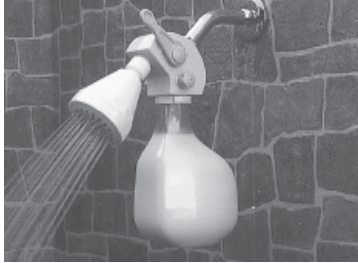
There's no fumbling with a bar of soap when you use the "Quick Shower". It consists of a detachable 32-oz. liquid soap container and a plastic showerhead.

The "Quick Shower" replaces your existing showerhead, simply threading onto the existing shower pipe. It consists of a detachable 32-oz. liquid soap container and a plastic showerhead. Asoap adjustment knob is used to control the amount of soap being dispensed, and an air adjustment knob controls the aeration or lathering action of the soap.