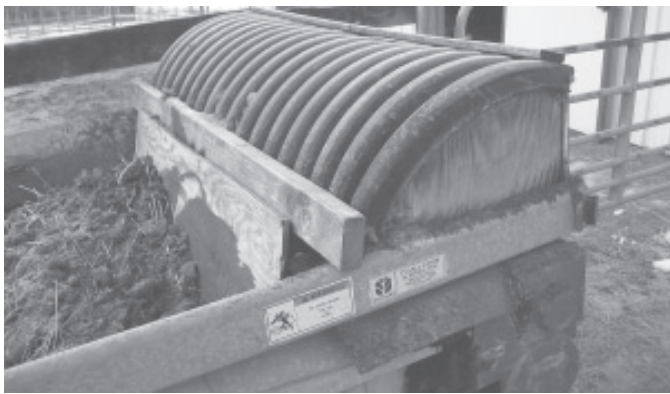
Homemade deflector attaches to back of New Idea manure spreader. It's made from a 1/3 section of a 28-in. dia. plastic pipe.