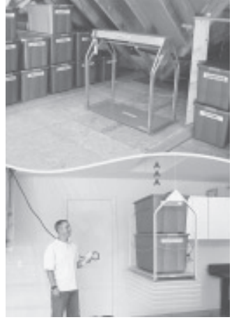
A wireless remote is used to raise platform to docking station in garage or shop attic. Model 32 with a floor-to-floor range of 14 to 20 ft. and a wireless remote.

Prices range from $1,185 for the Model 24 with a range of 8 to 11 ft. to $2,895 for the