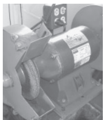
Bud Blanton stacked three chop saw wheels together and mounted them on his bench grinder. "Chop saw wheels cut at least twice as fast as grinding wheels," he

Each chop saw wheel measures a little more than 1/8 in. wide, so when three of them are stacked together you get a grinding area about 1/2 in. wide, says Blanton. He says you can stack as many of the wheels together as