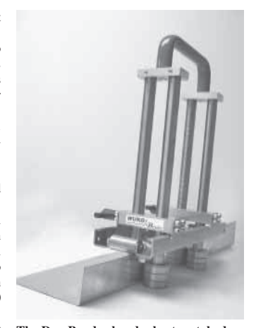
The Duo Bender bends sheet metal edges into 90 degree legs.

The Duo-Bender and the Disc-O-Bender are each priced at $950. The Mini Disc-O-