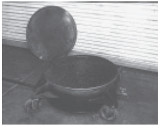
Oil pan on rollers is used to catch oil from engines. It was made by cutting up a 55-gal. barrel. Oil drains out a valve, at right, and a handle makes it easy to pull around.