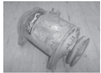
"Before" photo shows generator before it's converted from 6 to 12 volts.

"You can always send a part off to be made,