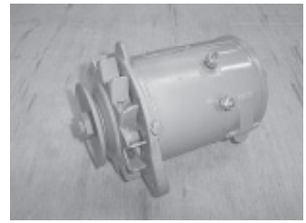
You still have the original generator on your tractor so the appearance won't change like it would with an alternator.

but it may cost more than it is worth," he says. "John Deere 70 nose cones break a lot. I checked with a foundry to see if they could get a housing recast, but tooling cost and startup required a minimum order of $100,000."