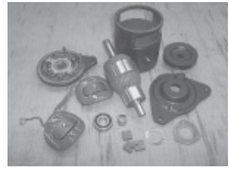
The company guts the generator, replacing or rebuilding all internal components.