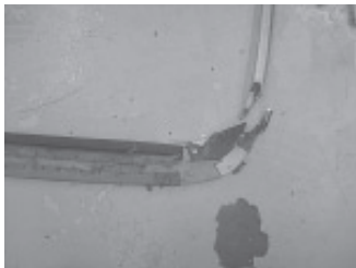
This broken piece of wood trim was repaired with PolyAll, which can be sanded down after drying.

Contact: FARM SHOW Followup, Striker, 200 Overhill Drive, Suite C, Mooresville, N.C. 28117 (ph 704-658-9332, info@striker1.com; www.strikerhandtools.com).