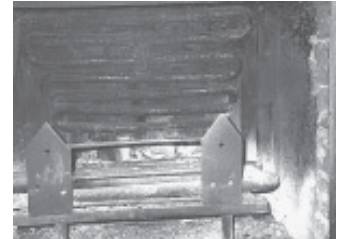
Heat exchange coil is made out of 1-in. stainless steel pipes in the firebox that pull heat out of the fire.

He usually heats the water in two 4-hour spans to 140 degrees or more. The open top tank prevents pressure from building in the pipes. At the same time, it serves as a constant source of passive heat release to the house. When the temperature in the living area drops, such as overnight, a fan kicks in, moving warm air from the utility room throughout the house.