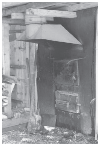
Modified 275-gal. fuel tank loads from outside to heat Yoder’s house and hot water.

The primary source of hot water for the house is a propane-fired water heater. However, when the stove is going, the propane isn’t needed. Yoder runs a water line through