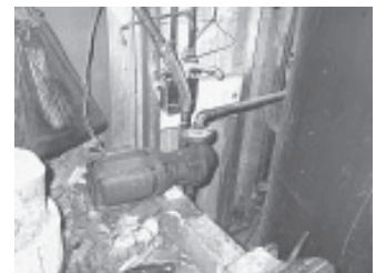
Pump pulls water from heat exchanger to storage tank.

“The surface of the water tank never gets below 80 degrees during the winter,” says Boice. He also designed the heater system in his fireplace. Fans switch on when air in the tubes at the back of the fire reach 90 degrees. As the fire burns down and the temperature in the tubes drops below 90 degrees, the fans shut down.