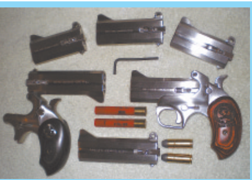
Interchangeable barrels allow this derringer-type handgun to shoot anything from a .410 shotgun shell to a full-size 45caliber bullet.

"The Mojave's compact size and ease of installation make it a great replacement unit," says Heutmaker. "It works equally well as a replacement heater or as an auxiliary unit. You can mount the heater horizontally or vertically, or at any angle so it can fit into a lot of different locations. The double squir-