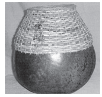
One variety of gourds is big enough to make coffee tables.

There can be a lot of batches to clean. Yields can reach as high as 150 wagon loads averaging 300 big gourds or 400 small gourds each. However, yields can be much