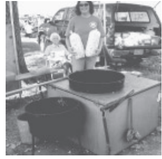
Home-built, gas-fired "butcher kettle" corn popper is built around a pair of 2ft. dia., cast iron hot butchering kettles.

"We now operate the popper four weekends every fall and run 750 to 800 lbs. of popcorn through it per season. All people