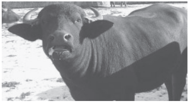
Dubi Ayalon has a water buffalo herd that he plans to milk for the first time next spring. Water buffalo milk is used to make authentic Italian-style mozzarella cheese.

Contact: FARM SHOW Followup, Sandlady's Gourd Farm, 10295 N. 700 W., Tangier, Ind. 47952 (ph 765 498-5428; sandlady@sandlady.com; www.sandlady.com).