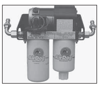
Air Dog filtration system pulls air out of fuel, cycling it back to the tank so positive pressure is maintained.

"You can put a switch on the line to run the filter without starting the engine and even put it on a timer to cycle fuel on a regular basis," says Ekstam. "It makes starting after