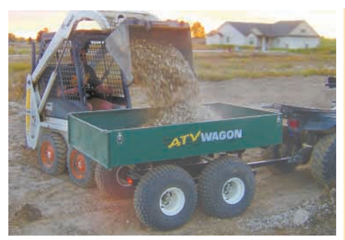
Bosski ATV Wagon bed lets you dump loads up to 1,100 lbs. at the touch of a button.