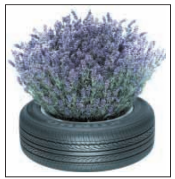
New scented tires release the aroma of lav-

The fragrant tires are no joke performance wise. According to the company, the heat resistant oils are believed to enhance the bonding of rubber chains, maximize elasticity and reduce braking distances on wet or dry roads. They feature four wide grooves to evacuate water and a silica compound to improve allweather performance and wet traction. High tensile steel belts and a jointless nylon cap improve ride comfort and durability, while an under tread reduces heat buildup for more consistent performance. Even the tread blocks are designed to create variable pitch lengths to minimize noise.