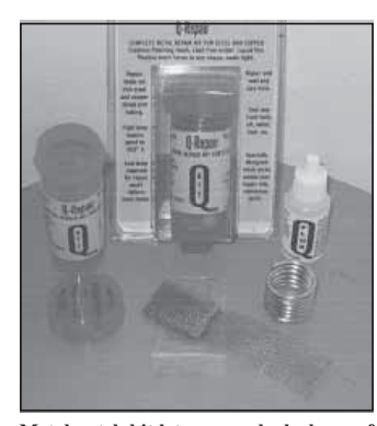
Metal patch kit lets you make leak-proof repairs on thin steel and copper. It consists of a flexible, 1-in, wide metal mesh that easily forms to any shape.

"Copper water lines that freeze usually split