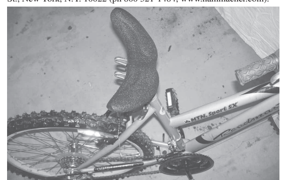
"It's the most comfortable seat on the market," says the manufacturer of the new "Moon Saddle". Mounts in place of any bike seat.

Contact: FARM SHOW Followup, Hammacher Schlemmer, 147 E. 57<sup>th</sup> St., New York, N.Y. 10022 (ph 800 321-1484; www.hammacher.com).