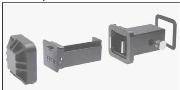
Mini vault slides into a 2-in. receiver hitch on any car or pickup.

The panic button is on a lightweight pendant that can be worn around the neck, clipped on a belt or carried in a pocket. The transmitter signal reaches up to 600 feet line of sight. The button must be held down at least 2 seconds to call