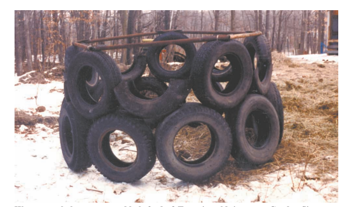
Want a tough, low-cost round bale feeder? Try using old tires, says Gordon Siemers.