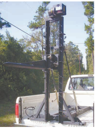
Lift mechanism has an electric winch operated by a toggle switch in cab.

"I came up with the idea eight years ago when I was sitting at a red light and a truck