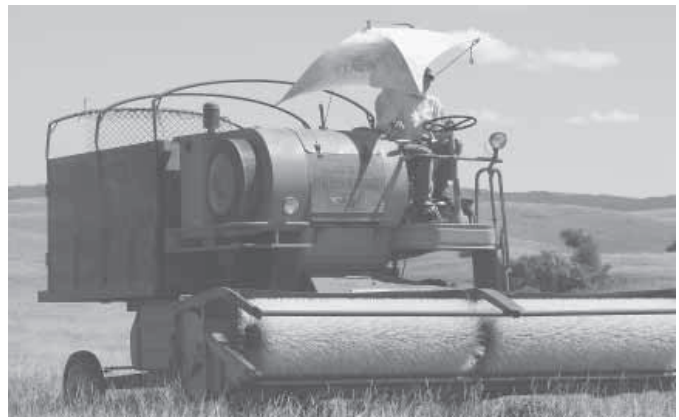
Brothers Ray and Angus McDougald converted a 1960's Massey 300 combine into this grass seed harvester, mounting a custom-built, 28-in. dia. brush on front.

The McDougalds harvest spear grasses such as “western porcupine” and “needle and thread”. They also harvest “rough fescue,” but it only sets seed about twice in a 10-year period, according to Ray.