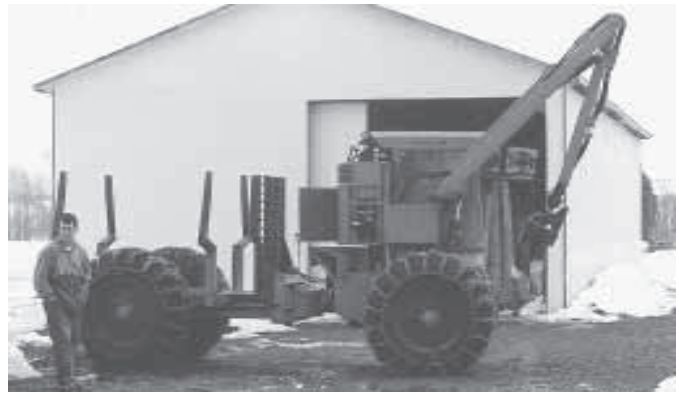
Log-loading tractor has a front-mounted boom that swings to either side.