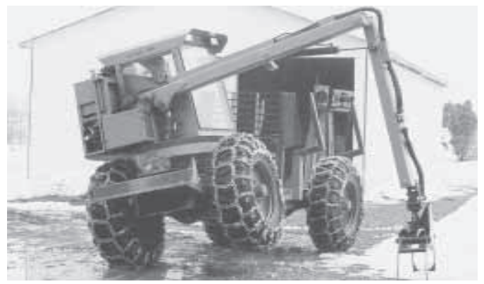
Cab and boom rotates 180 degrees, allowing operator to load logs on back.