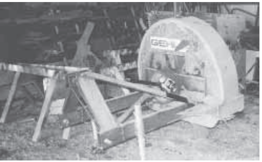
Pitcher made this 3-pt. mounted rotary ditcher by cutting the bottom out of an old Gehl silage blower. He used 2 by 6 box steel to make a 3pt. mounting bracket.

Contact: FARM SHOW Followup, Rick Plavidal (ph 970 596-1787; rick@ ridgway structural systems.com; www. ridgway structural systems.com).