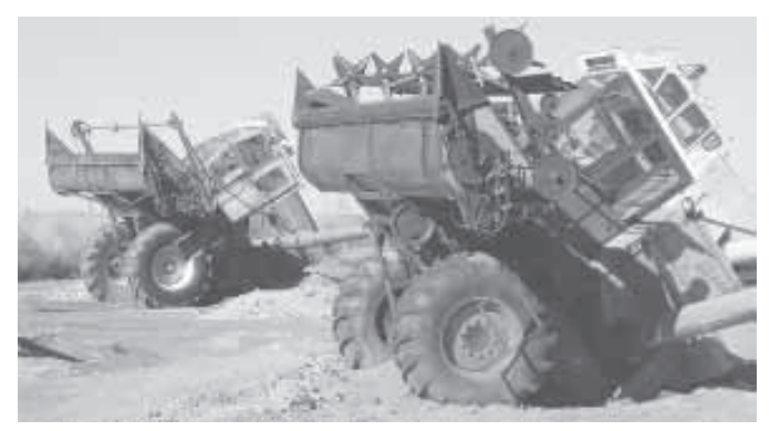
Fourteen different combines have found their final resting place at "Combine City".