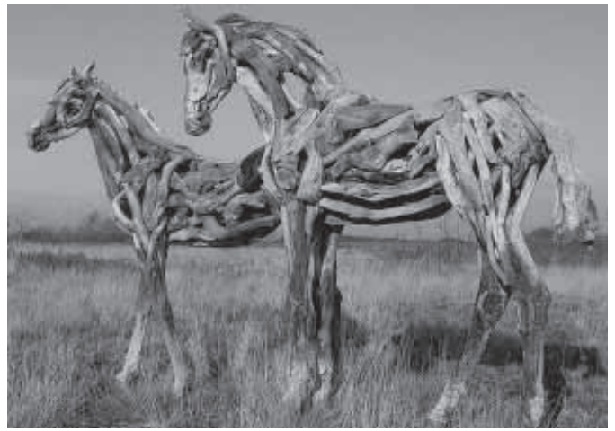
Finding pieces with just the right size or shape is a challenge. "It's like a 3-dimensional jigsaw puzzle," says Jansch.

Contact: FARM SHOW Followup, Heather Jansch, Exeter, South Devon, England (ph 011 44 07775 840513; heather @heatherjansch.com; www.heatherjan sch.com).