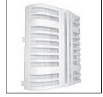
Available Cub parts from Steiner Tractor include carburetor (left), front grill (right), bottom cushion (below left) and throwout bearing.