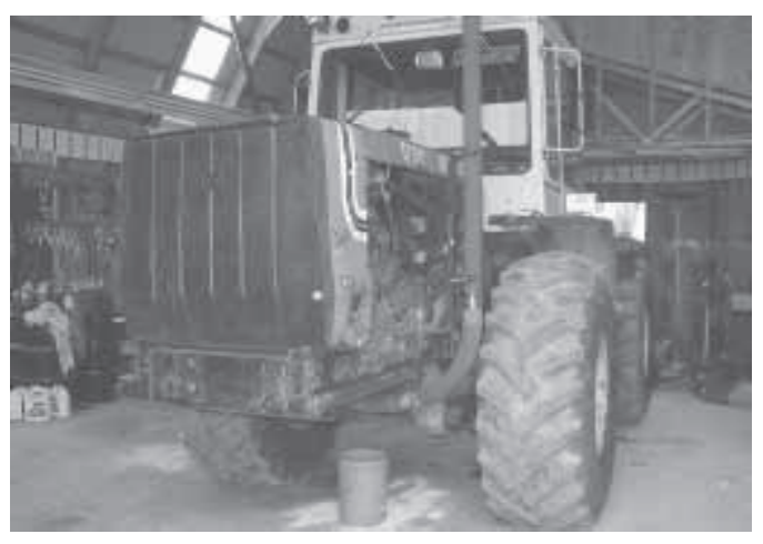
It took quite a bit of fabrication work, but Jim Ward was able to replace the engine in a Belarus 1790 4-WD tractor with a 466 DDT International.

Contact: FARM SHOW Followup, Steiner Tractor Parts, Inc., PO. Box 449, 1660 South M-13, Lennon, Mich. 48449 (ph 810 621-3000 or 800 234-3280; fax 810 621-3099; sales@steinertractorparts.com;